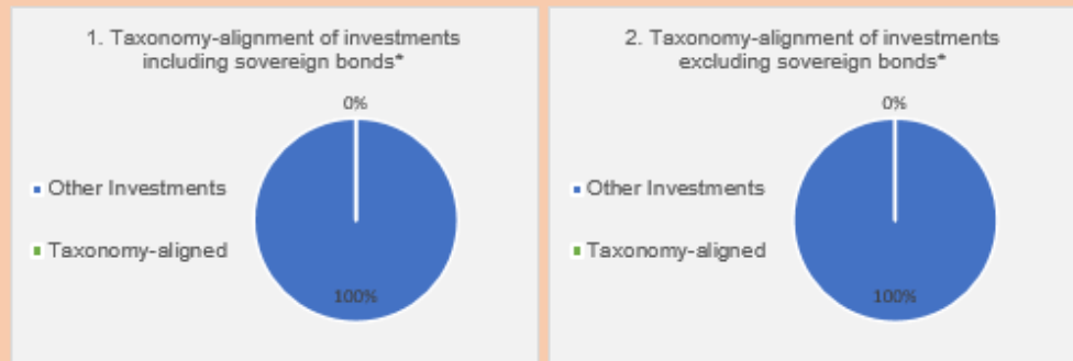
*In these graphs "sovereign bonds" refer to all exposures in sovereign securities

The two graphs below show in green the minimum percentage of investments that are aligned with the EU Taxonomy. As there is no appropriate methodology to determine the Taxonomy-alignment of sovereign bonds*, the first graph shows the Taxonomy-alignment in relation to all the investments of the financial product including sovereign bonds, while the second graph shows the Taxonomy-alignment only in relation to the investments of the financial product other than sovereign bonds.